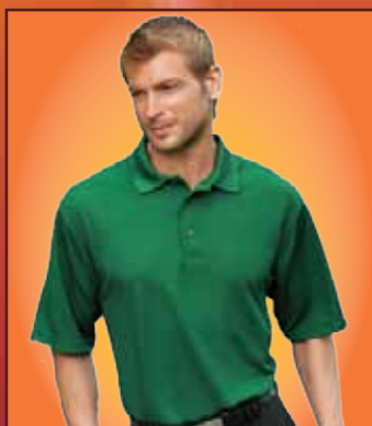
Paragon Men's Performance Mesh Polo Black, Gold, Grey, Heather, Kelly, Navy, Red, Royal, White S - 3XL $22.65 Includes 6,000 stitches of embroidery