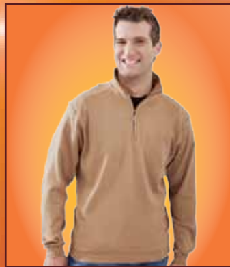
Bermuda Sands Men's Tyvola 1/4 Zip Pullover Jacket Black, Cabernet, Taupe S - 3XL $48.35 Includes 6,000 stitches of embroidery