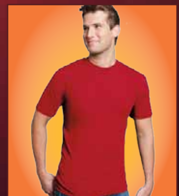
Trecento Men's Perfect Fit Super Soft Cotton Tee Asphalt, Baby Blue, Black, Brown, Cranberry, Grass, Heather Grey, Kelly, Navy, Purple, Red, Royal, Slate, White S - 3XL $7.65 Includes a one color screen print

*24 piece minimum Call for pricing on other quantities Offer Expires January 31st, 2012 Pricing for S-XL