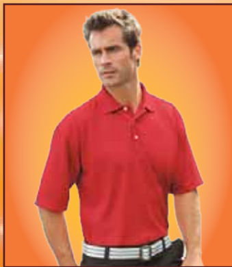
Bermuda Sands Men's Bahama Performance Polo Black, Red, Royal, White S - 3XL $29.50 Includes 6,000 stitches of embroidery