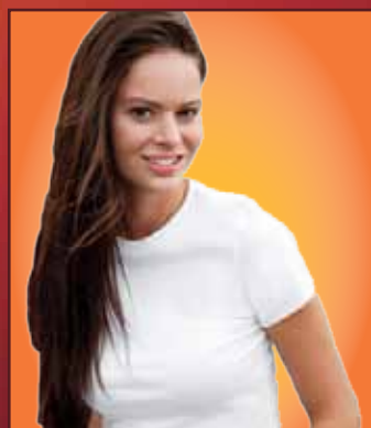
Trecento Ladies Perfect Fit Super Soft Cotton Tee Asphalt, Baby Blue, Black, Brown, Cranberry, Kelly, Heather Grey, Navy, Purple, Red, Royal, Slate, White S - 2XL $6.75 Includes a one color screen print